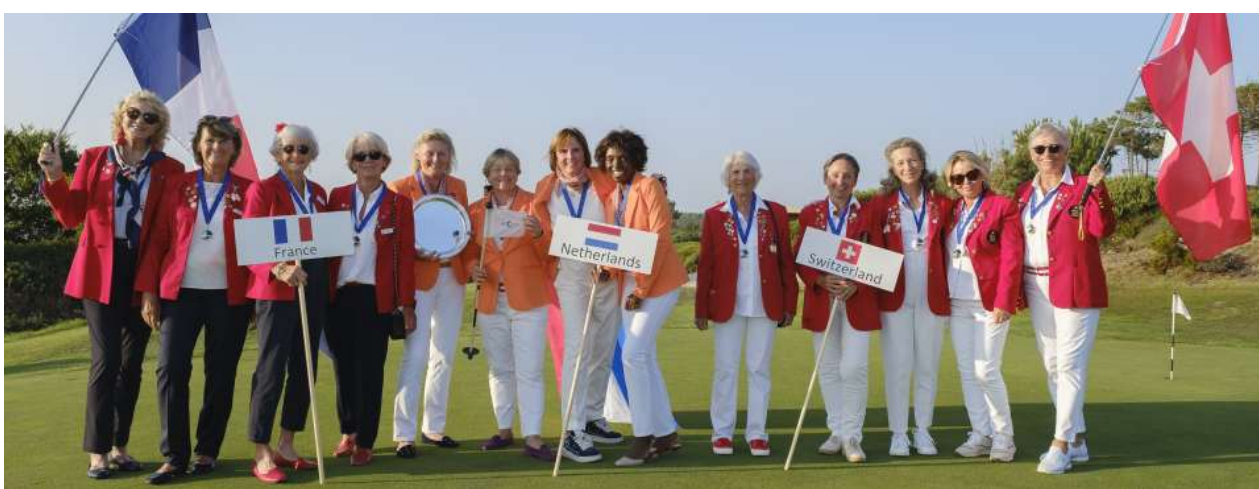
The medalists from 2025, Marisa Sgaravatti Trophy at the top and Masters Team Championship at the bottom.